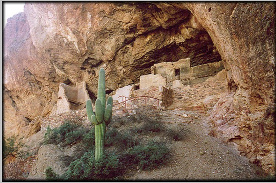
Lower Cliff Dwellings at Tonto National Monument, Arizona.

To the ancients who inhabited the myriad canyons of the Colorado Plateau, they must have seemed like gifts bestowed from above, or maybe their presence was a portent of things to come. Looking up from the narrow river and creek bottoms where life was easy, at least for that moment, the Indians took note of the immense hollows seemingly carved in numerous places into the sheer canyon walls above them.