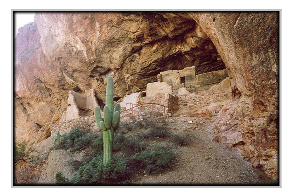
Lower Cliff Dwellings at Tonto National Monument, Arizona.

To the ancients who inhabited the myriad canyons of the Colorado Plateau, they must have seemed like gifts bestowed from above, or maybe their presence was a portent of things to come. Looking up from the narrow river and creek bottoms where life was easy, at least for that moment, the Indians took note of the immense hollows seemingly carved in numerous places into the sheer canyon walls above them.